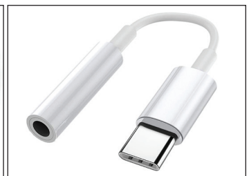
TRRS to USB-C Adapter *Android devices require OTG