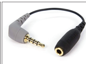
Rode SC4 3.5mm TRS to TRRS Adapter TRS to TRRS Adapter (Rode SC4)