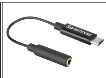
TRS to USB-C Adapter (SR-C2003) Samaronic SR-C2003 *Android devices require OTG